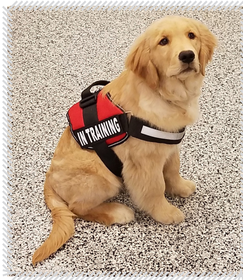
(Above) Service Dog Training can start at 8 weeks of age.

With applicants tripling in the past year, so has the need to interview potential clients for service and hearing dog training. We’ve grouped the applicants for an initial introduction to our Service Dog Training Program. Many who already own dogs will be informed of the criteria for service dogs and then be set up for a dog temperament evaluation later. Others will be placed on a waiting list until an appropriate dog is found. Potential clients and future volunteers