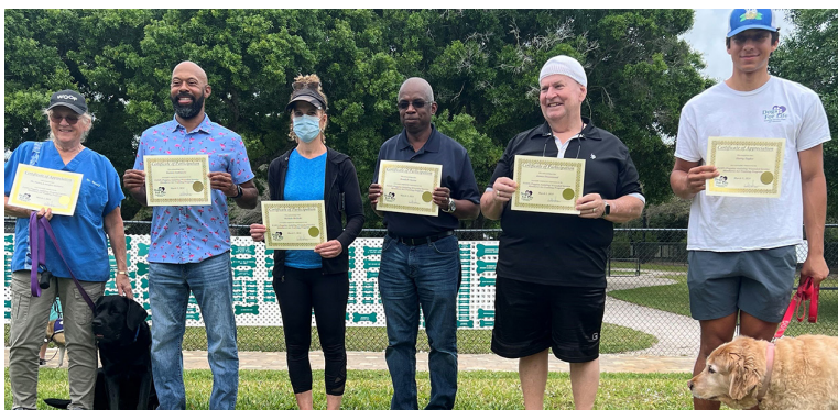
PAWS Program Graduates pose with DFL representatives. Left photos top to bottom: Cohort 5, Cohort 6. Right photo: Cohort 4.