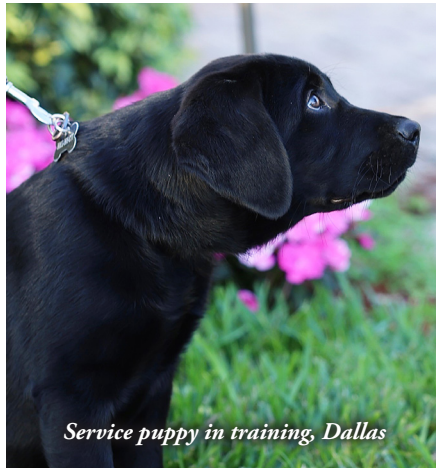
Service puppy in training, Dallas