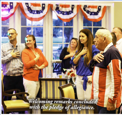
Welcoming remarks concluded with the pledge of allegiance.