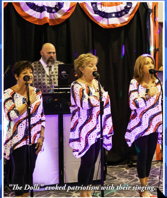
"The Dolls" evoked patriotism with their singing.