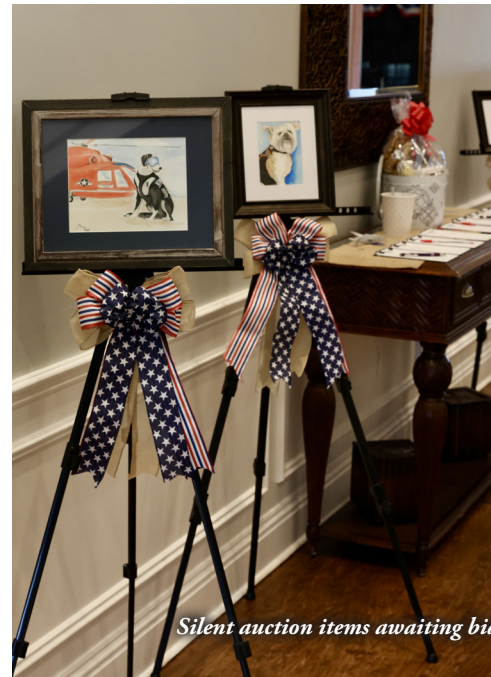
Silent auction items awaiting bids.