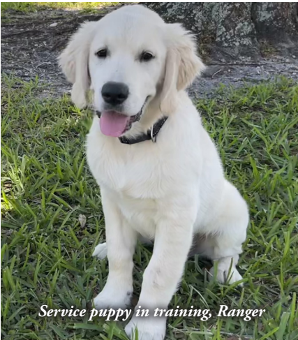
Service puppy in training, Ranger