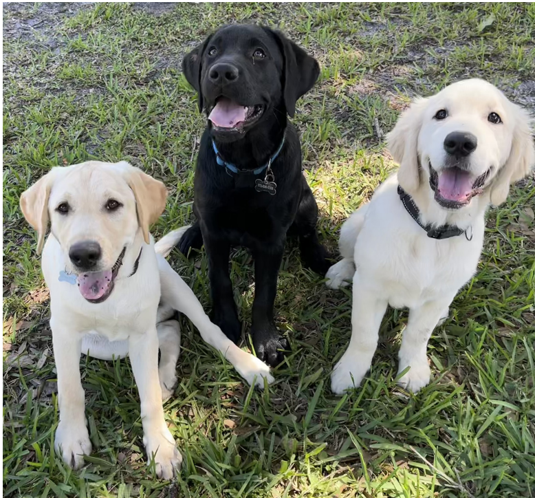
New service puppies in training, Austin, Dallas, and Ranger.

Austin, Ranger, an eight-week-old Golden Retriever pup, came to DFL. Ranger is a local, born in Vero Beach, and happens to be service dog Indy's brother. Though younger than Dallas and Austin, Ranger is doing a great job keeping up with his older schoolmates in puppy class, and already shows signs of becoming as