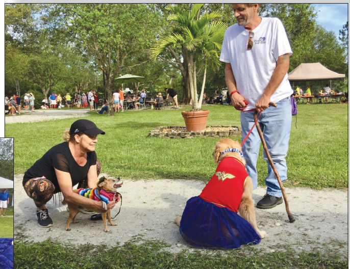
2017 Pawrade participants enjoy the festivities.