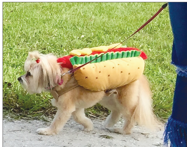
Halloween veterans on duty, Halloween Pawrade October 20, 2018 and all dogs win a prize!